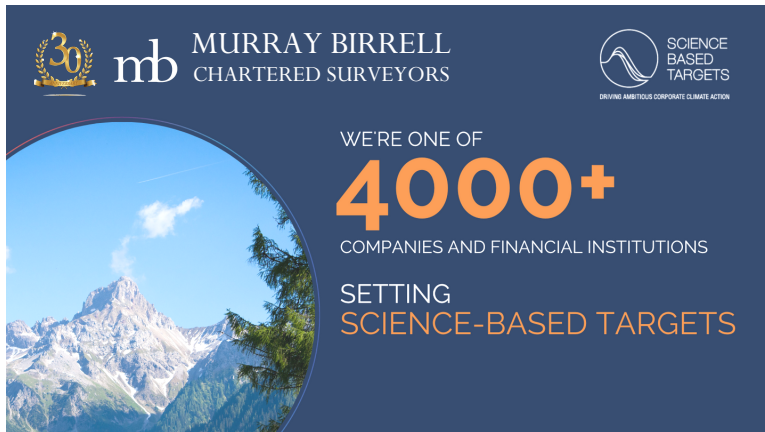
Murray Birrell's Carbon Footprint Reduction Target Receives Gold Standard Validation

The Science Based Targets initiative (SBTi) is a global body enabling businesses to set ambitious emission reduction targets in line with the latest climate science. It is focused on accelerating companies across the world to halve emissions before 2030 and achieve net-zero emissions before 2050.